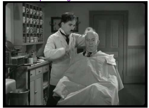
https://www.youtube.com/watch?v=U0f42NBrIUg Images for Charlie Chaplin: Hungarian Dance No.5 - YouTube

Charlie Chaplin: Hungarian Dance No.5. - YouTube